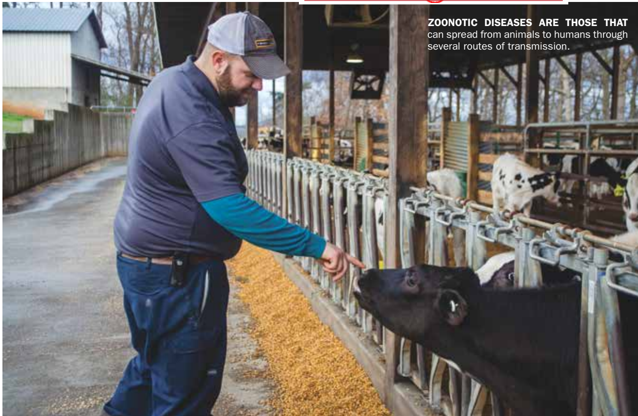
ZOONOTIC DISEASES ARE THOSE THAT can spread from animals to humans through several routes of transmission.