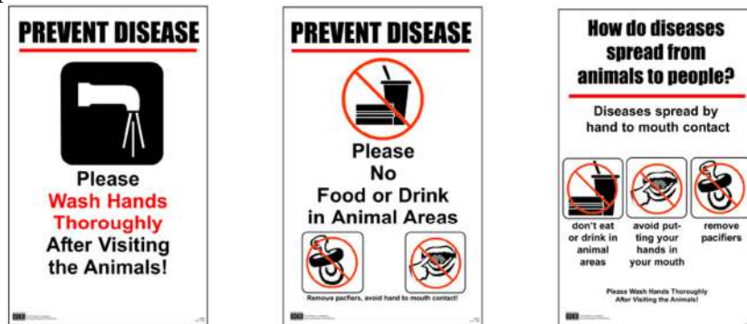
Figure 2. Free educational posters available for use at fairs and other public animal contact venues.